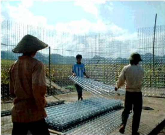
HANDLING THE JK PANELS