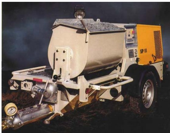
CONCRETE MIXER & PUMP