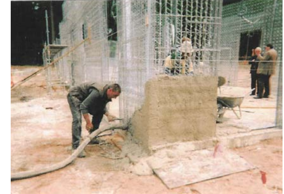
INJECTING THE ALLEVIATED CONCRETE