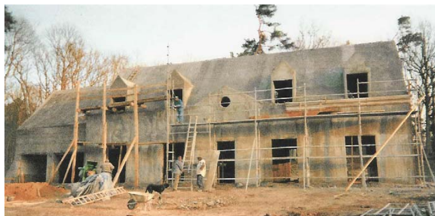
HOUSE CONSTRUCTION SITE